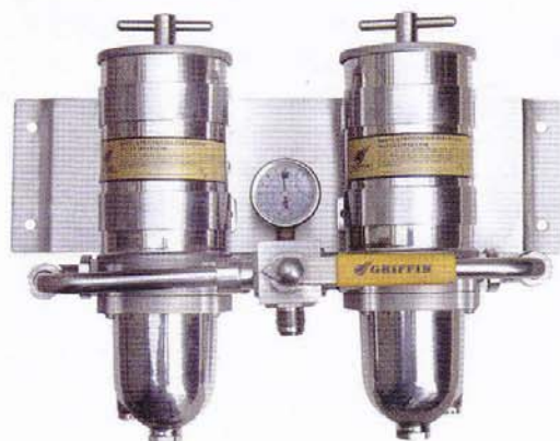
Fully stainless steel fuel filter/ Water separator MAS series.

To better serve its customers, Griffin Group has developed an international distribution network and its filtration technology and support is available to customers worldwide. Griffin Group joined ASMI as Associate Member in 2012. It has participated in many trade exhibitions worldwide under the Singapore Pavilions organised by ASMI and supported by IE Singapore.